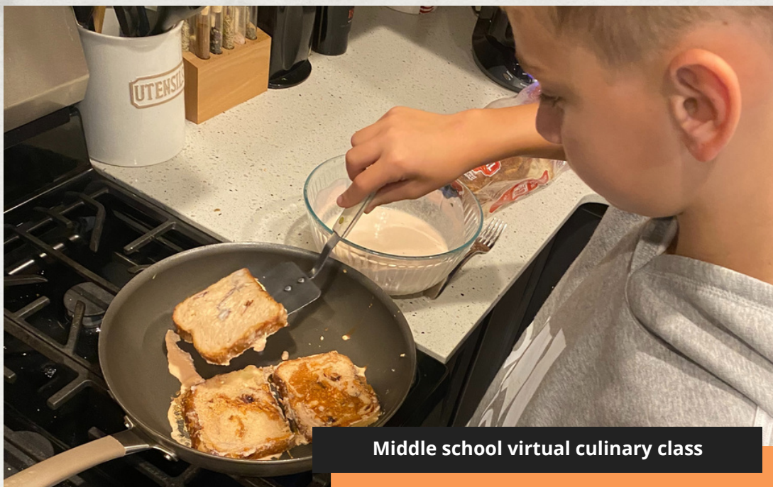
Middle school virtual culinary class